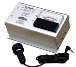
UV Monitor (Part # 4-UV/MS-1/2 V3)

Special Filtration - If other contaminants are present, such as Arsenic, Fluoride, Nitrate or other pollutants, or if the pH needs to be adjusted, additional filtration levels can easily be added to this system.