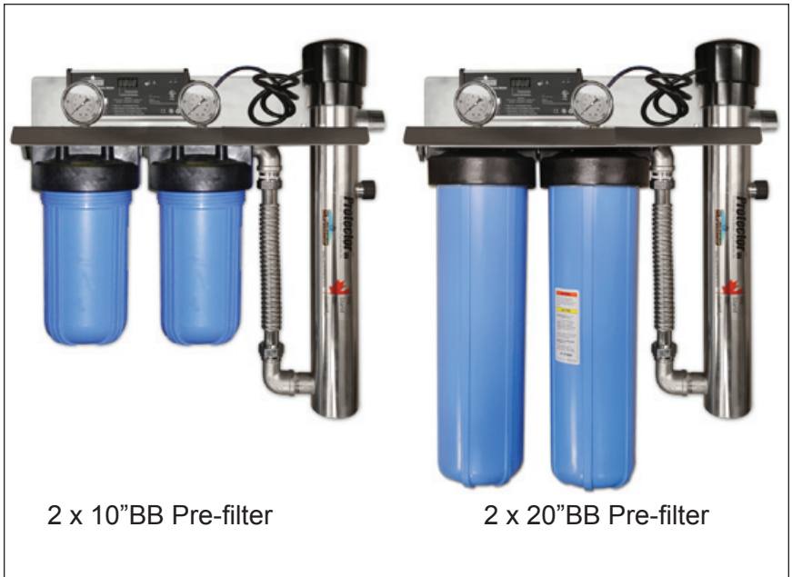
2 x 10"BB Pre-filter